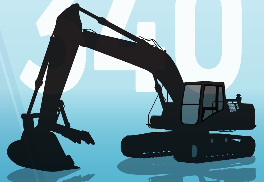
Tons of scrap metal recycled