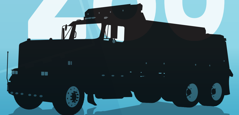
Loads of concrete/fill material recycled