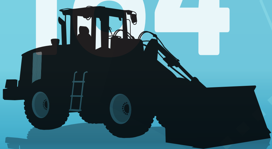
Thousand square feet demolished