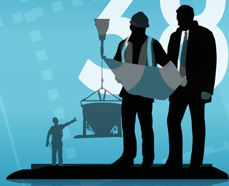
Acres to be made ready for development